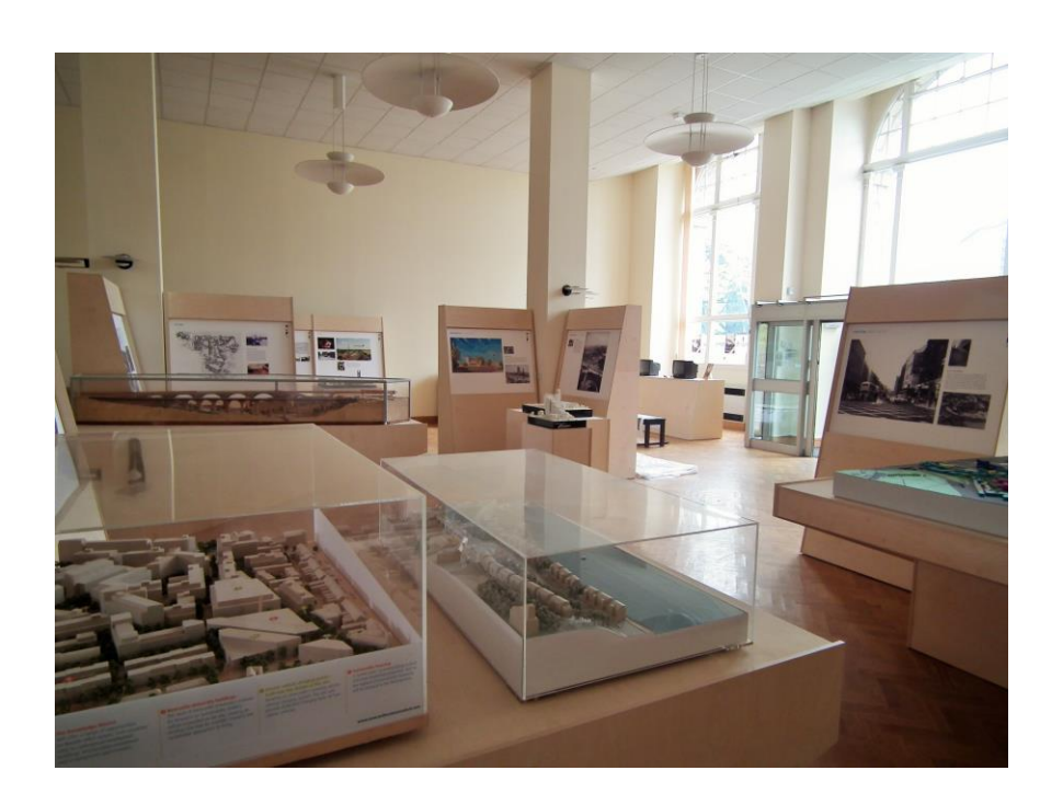
Images from Newcastle City Futures exhibition.